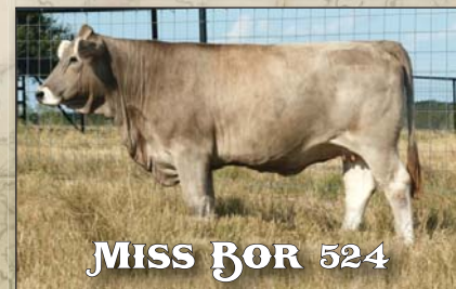
MISS BOR 524