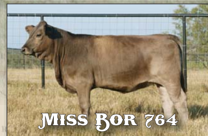
MISS BOR 764